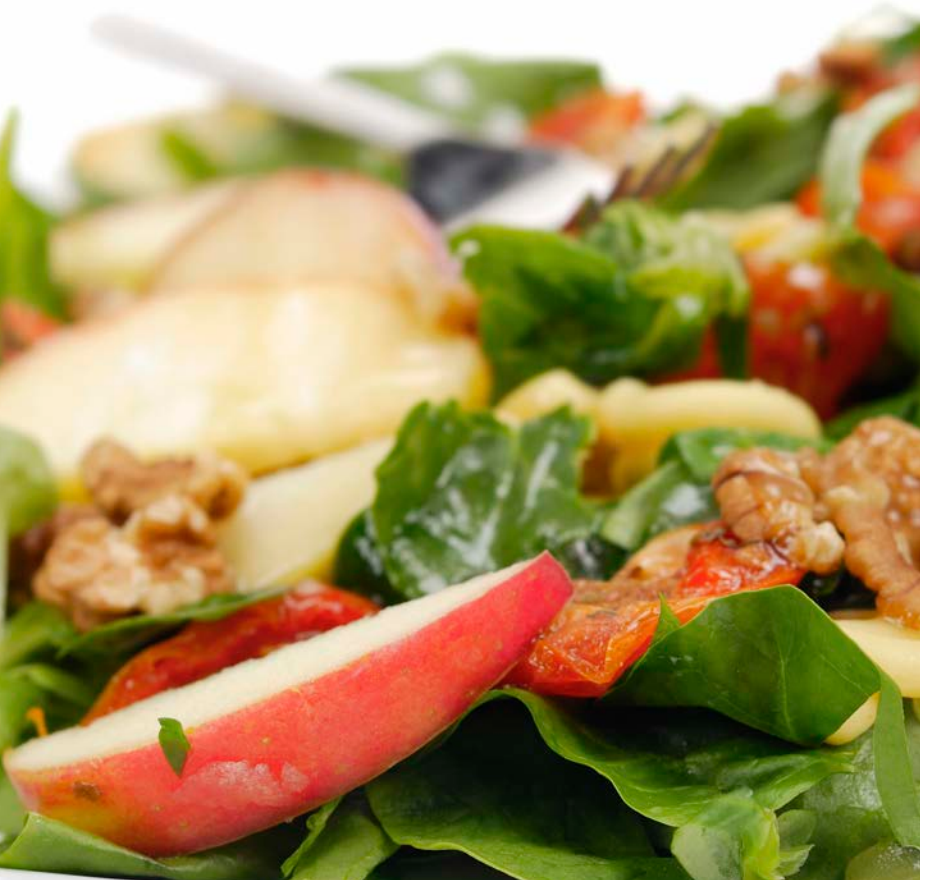
SALAD BOXED LUNCH FAMILY STYLE SALAD BOWLS SOUP & SALAD COMBO